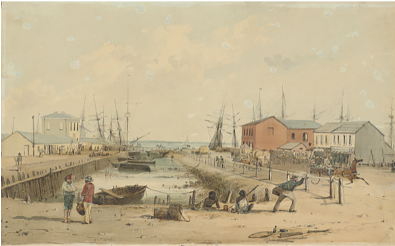
Port Adelaide