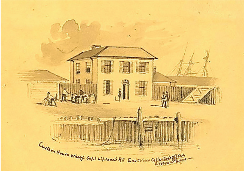
Custom House Wharf, Collectors Office, East View, Port Adelaide 184?