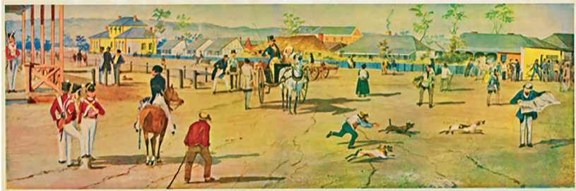
North Terrace, Adelaide 1845 (State Library of South Australia, B7170)

When Light completed surveying the city, the town acres not purchased before settlement were auctioned in one-acre lots, and the temporary campers who could afford to buy quickly claimed their new town lands. The first building material was wood from lands around the River Torrens. The original inhabitants