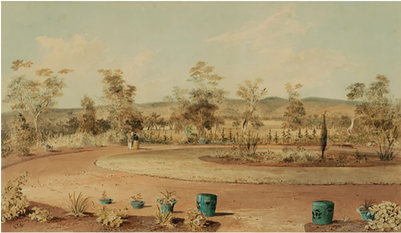
From Verandah of Vale Farm