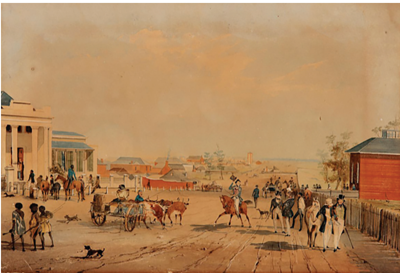
Bank of South Australia and Legislative Council Room, North Terrace, Adelaide