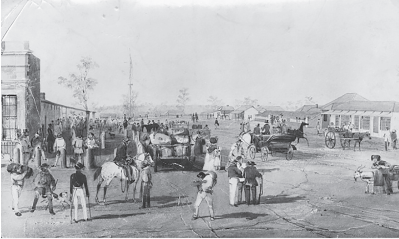
King William Street, looking north 1845 (State Library of South Australia, B3697)

and parks of Adelaide, painting and drawing many streetscapes, such as the two examples below, which are full of activity (in the left foreground of the North Terrace image, members of the British Regiment then stationed in Adelaide appear).