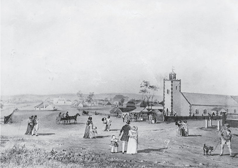
North Terrace, showing Trinity Church