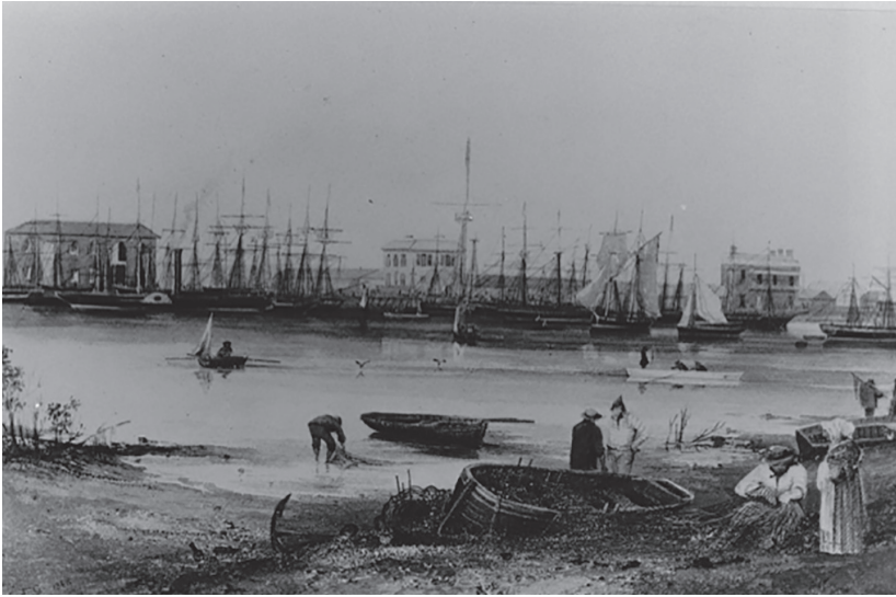
Port Adelaide 1848 (Note: Steamship Juno far left was the first vessel to steam up the Port River in 1847)