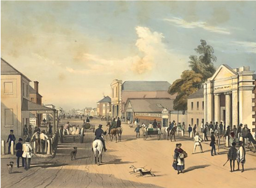
Hindley Street from the corner of King William Street c. 1847