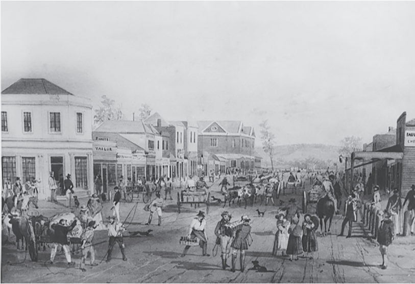
Rundle Street, looking east from King William Street c. 1845

Gill's paintings of Adelaide streets in the 1840s provide wonderful images of mid-nineteenth-century Adelaide. They include paintings of Government House (North Terrace), North Terrace looking south-east, Hindley Street looking west, Hindley Street looking east, Rundle Street, Rundle Street looking west, and Hindley Street from King William Street. In each case, there are a range of people, animals, and activities depicted in each painting. Gill arranged people and animals in each of his street scenes to create a carefully orchestrated and interesting composition. The selection of colour for costumes and clothing added to the impact of the paintings. His set of paintings and drawings of Adelaide streets and architecture provided a comprehensive record of customs, dress, accoutrements, architecture, and modes of transport of colonial Adelaide in the 1840s.