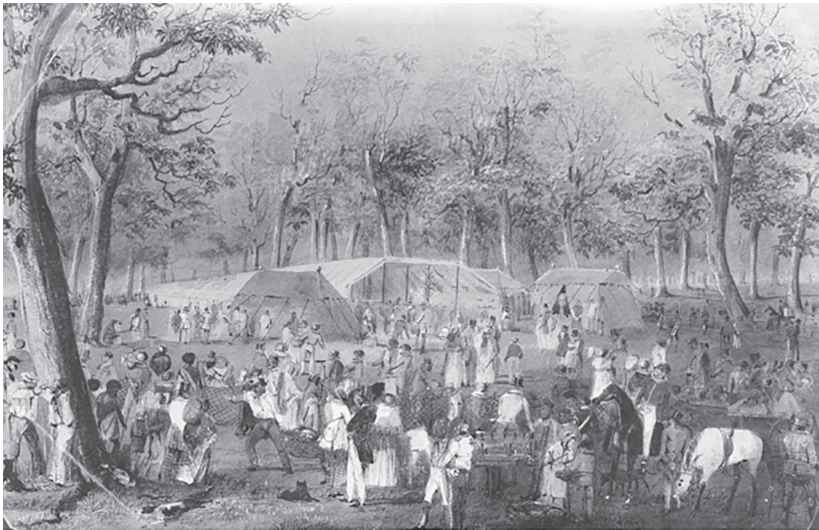
Agricultural and Horticultural Show 1845 (State Library of South Australia, B16066, photograph of sketch)

The early development of the Agricultural and Horticultural Society of South Australia led to the conduct of an annual agricultural and horticultural exhibition. The fourth of these exhibitions took place in Adelaide in 1845 and was recorded in two paintings by Gill ( Agricultural and Horticultural Exhibition Parklands 1845 ). He also produced sketches and two watercolours on the same theme, each containing lots of people and activity. These events were an important celebration for the settlers; they were able to showcase the variety of fruit, vegetables and grains they produced for local consumption and for export. Gill would have enjoyed recording these events as he excelled at capturing the bustle and life of crowd scenes.