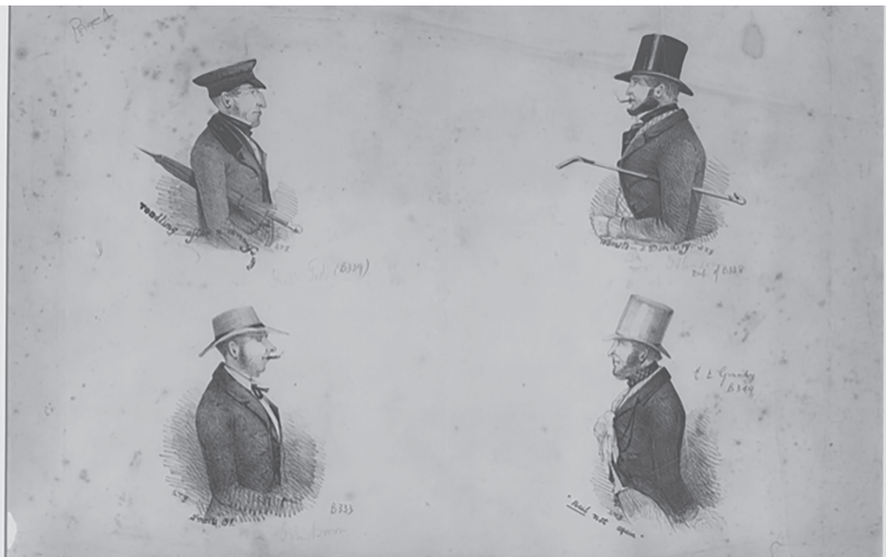
Heads of People (Sheet 3) (State Library of South Australia, B71555)

...twelve lithographic sketches of colonists—all pretty well known—have been published during the week under the title 'Heads of People'. They are from the pencil of Mr Gill and show that the ability of this artist is not confined to landscape drawings but that it extends to a branch of art hitherto unexplored by him. These sketches are for the most part well done, one or two of them inimitable; and there is just that spice of quiet humour, bordering upon caricature, which redeems them from the dull monotony of staring portraits, without the slightest offence to the individuals introduced.